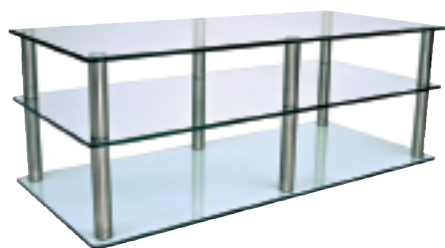
6 pole top shelf option shown