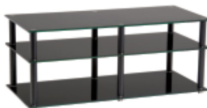
6 pole top shelf option with black glass option shown